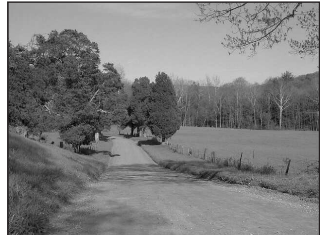
Flood Bridge Road

HIKING*HIKING*BRING THE FAMILY*BRING A FRIEND*HIKING*HIKING